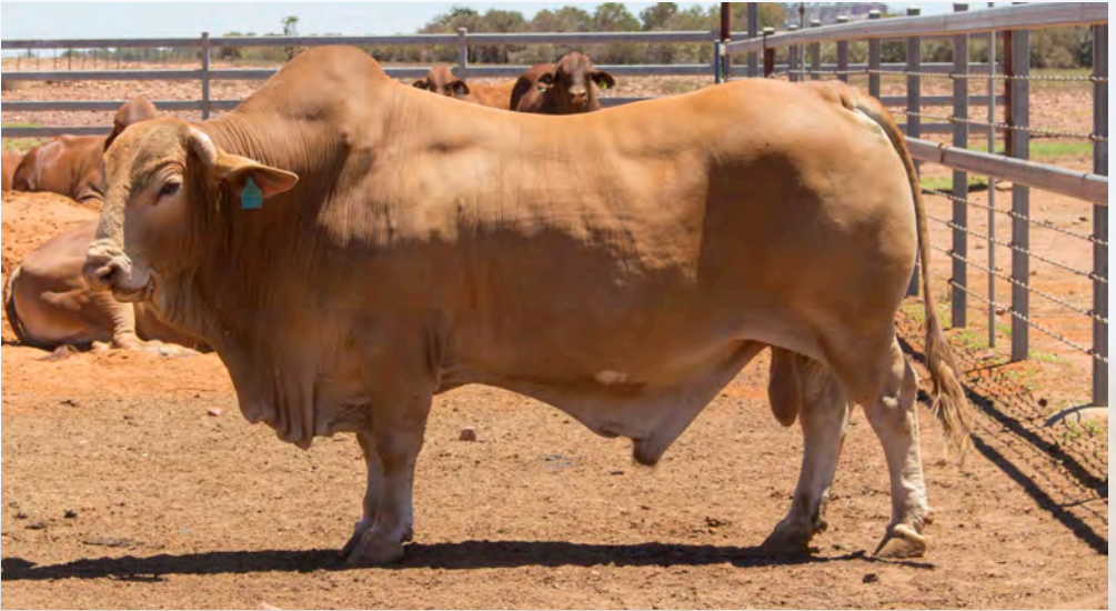
Birch Mufasa: Sire of Lot 96