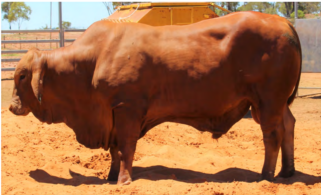
VALERA VALE 15064M: By Amavale Bradman and sire of lots 10, 16, 30 & 41