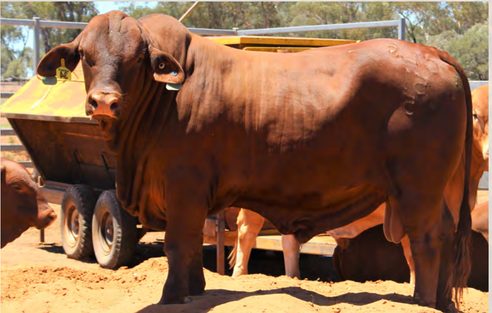
GLEN FOSSLYN 15451: Sire of lots 73 & 86. Unregistered bull: GF 15451 progeny cannot be registered