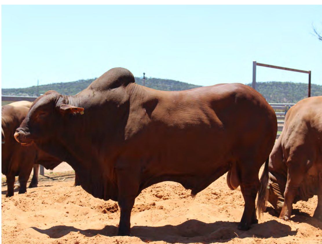
VALERA VALE GAZZA 106: Sire of lots 13, 26 & 70