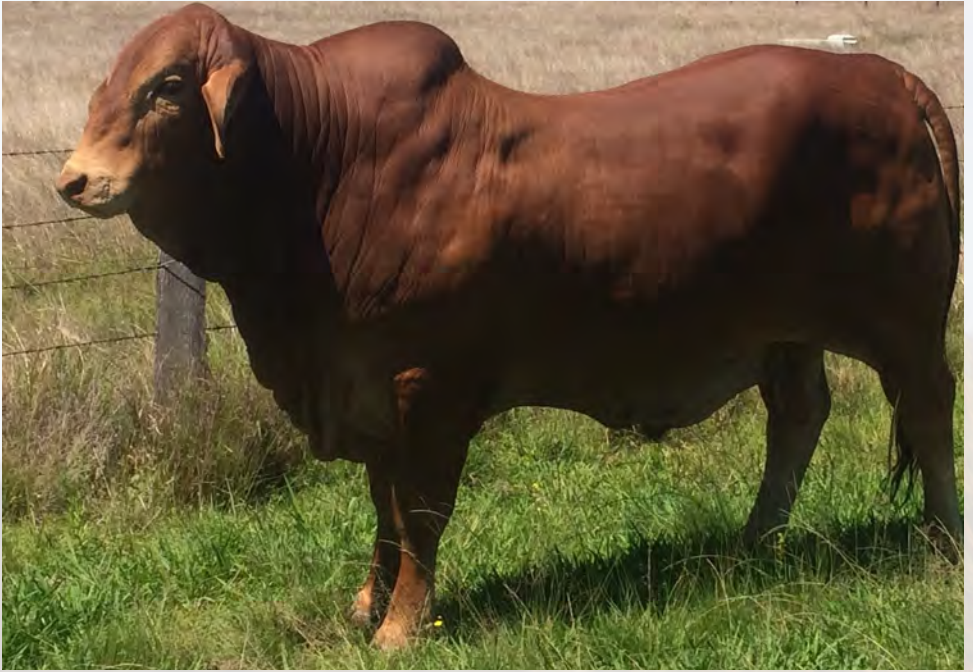
LYNSEY PARK LAYTON: Sire of lots 8 & 14