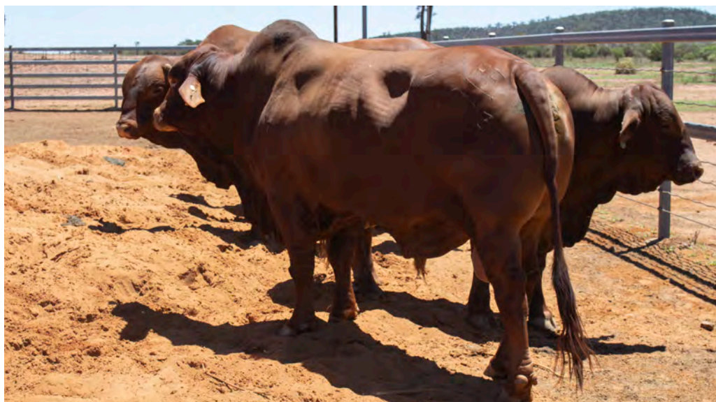
VALERA VALE GARFIELD 073: Sire of lots 20 & 46