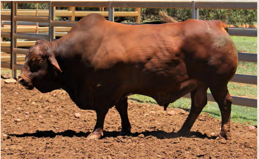
TALGAI FERGUS: Sire of lot 79