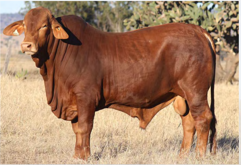
WAJATRYN 1403: By Redskin X-Factor. Sire of lot 49