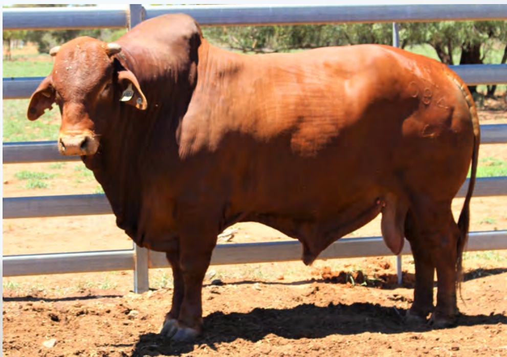
VALERA VALE GARRISON 084: Sire of lots 9, 66 & 91 Sold to High Country stud.