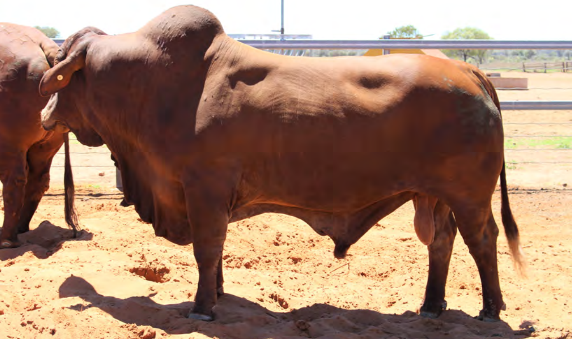
VALERA VALE FLYNN 034: By Shardale Esko and sire of lots 2, 5, 64, 67, 82, 92 & 93. FLYNN 034 has been sold to High Country Stud