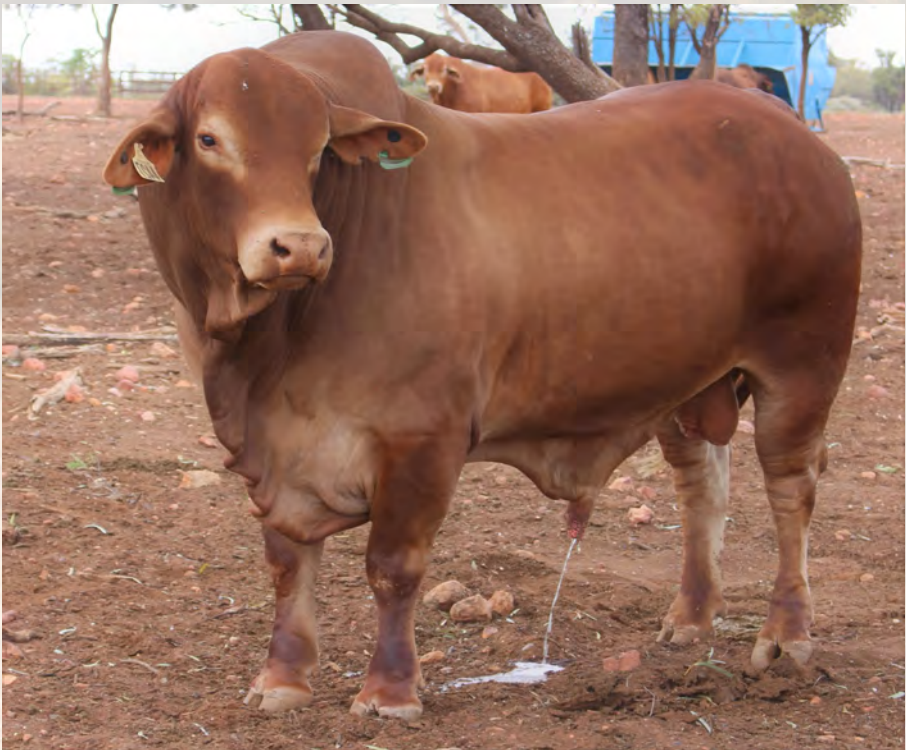
VALERA VALE GRAHAM 427M: Sire of lots 19,23, 48, 52, 69 & 90