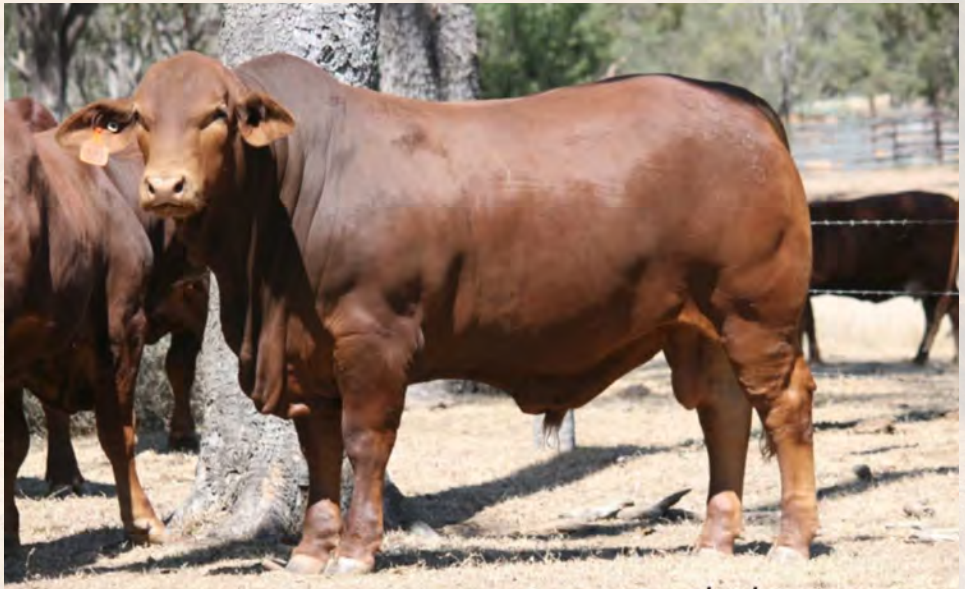
EVERSLEIGH JUGGERNAUT: Top priced bull at the 2017 Roma Tropical Breeds Sale ($30,000). First sale calf is Lot 59