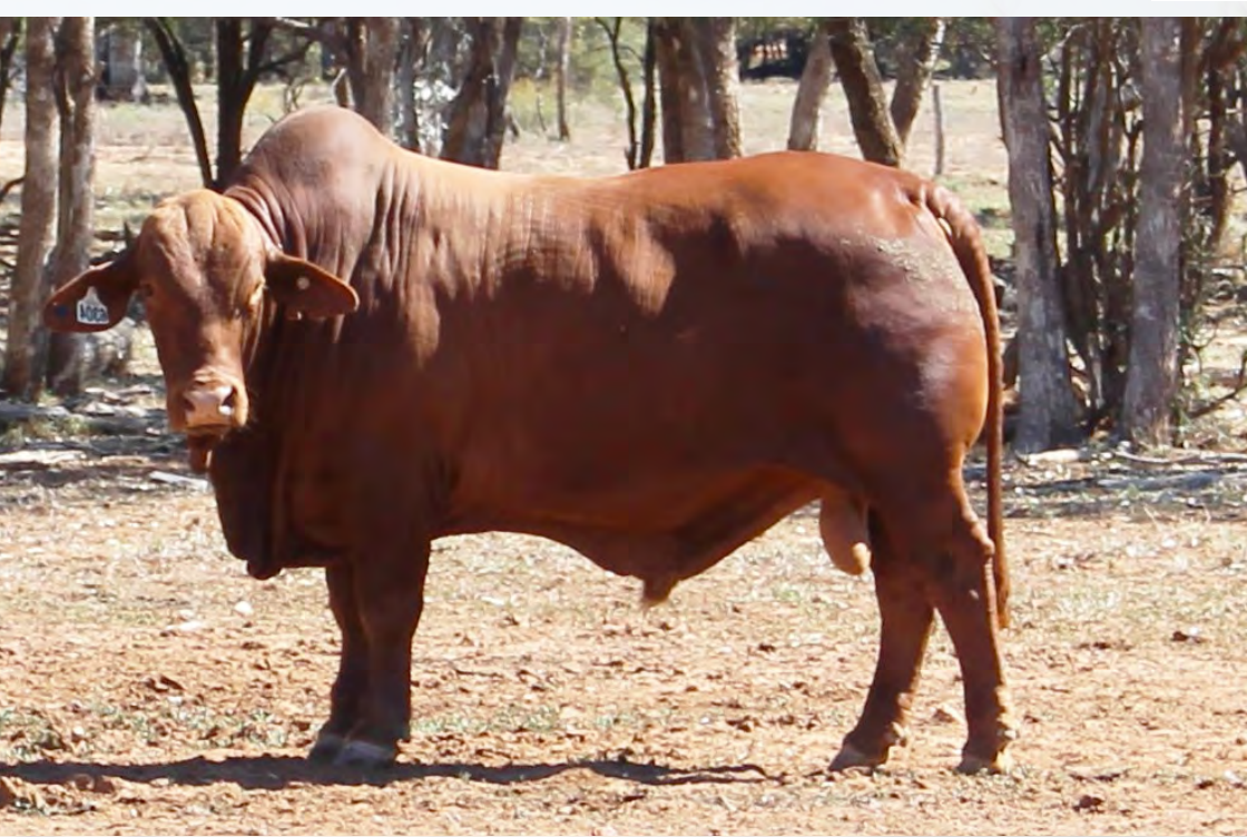
VALERA VALE 16304M by Talgai Fergus: Sire of Lots 78 & 89