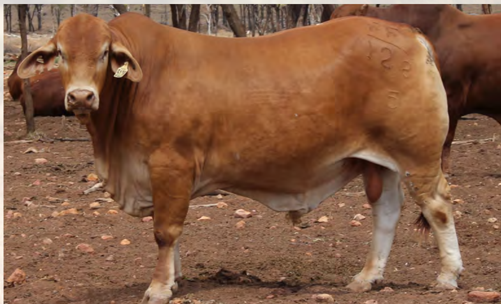
VALERA VALE 5128M: Sire of lot 11 (photo at 2 years old)