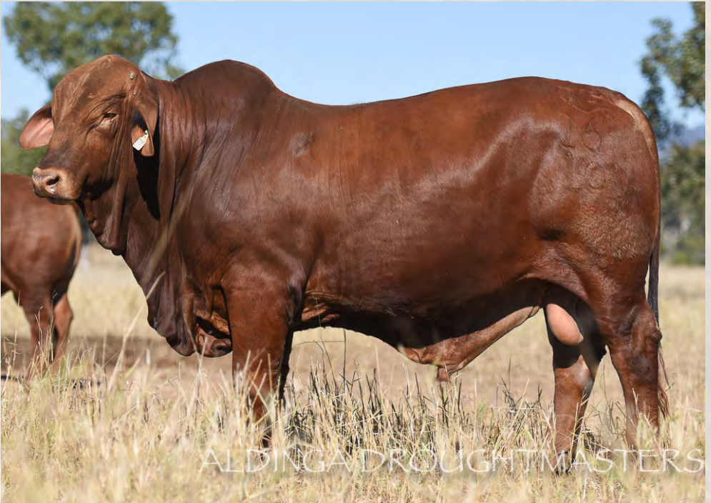
ALDINGA HUNDRED: Top priced bull at the 2017 Aldinga sale. He is doing a great job for us. Sire of Lots 21 & 33