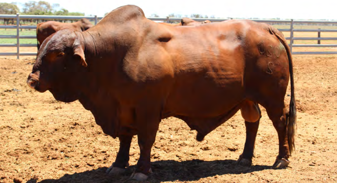
VALERA VALE 2020: Sire of lot 42 & 80