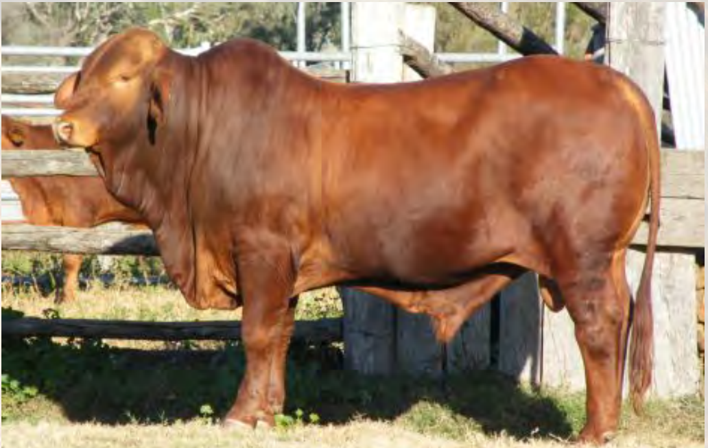
LYNSEY PARK VERNON: One of the best bulls we've ever owned. Sire of lots 3, 4, 17, 56, 63, & 75 Unfortunately lost last year.