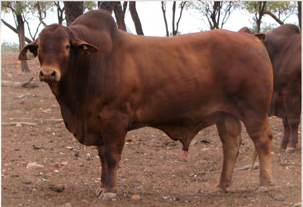
VALERA VALE GODFREY 414: Sire of lots 28, 50, 94 & 98. CFA this year dressing 541 Kg at Dinmore in working condition.