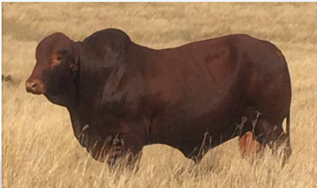
VALERA VALE BAZZA 151: Sire of 3 sires represented in this catalogue (Garfield, Garrison, & Gazza) and sire of lot 55