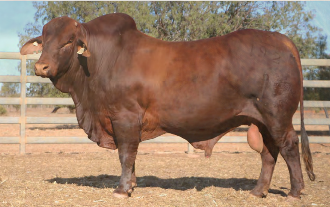
VALERA VALE 16192 by Lynsey Park Vernon: Sire of lots 29 37, 65, 67 & 81