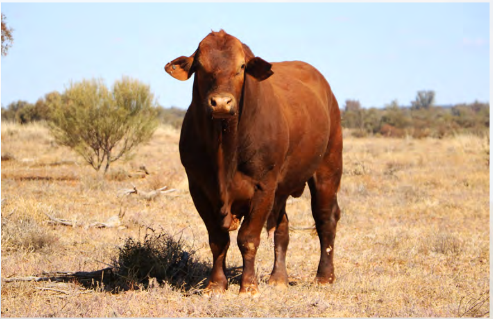
CLONLARA 16110. Purchased for $16,000 at the 2017 Clonlara Sale, a big growthy bull & sire of Lots 45, 58, 72 & 97