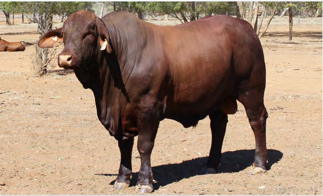
VALERA VALE 16101M (by Lynsey Park Vernon): Sire of lots 44 & 54