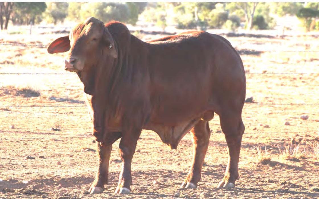
VALERA VALE ERNIE ADAMS 501: Sire of lot 76