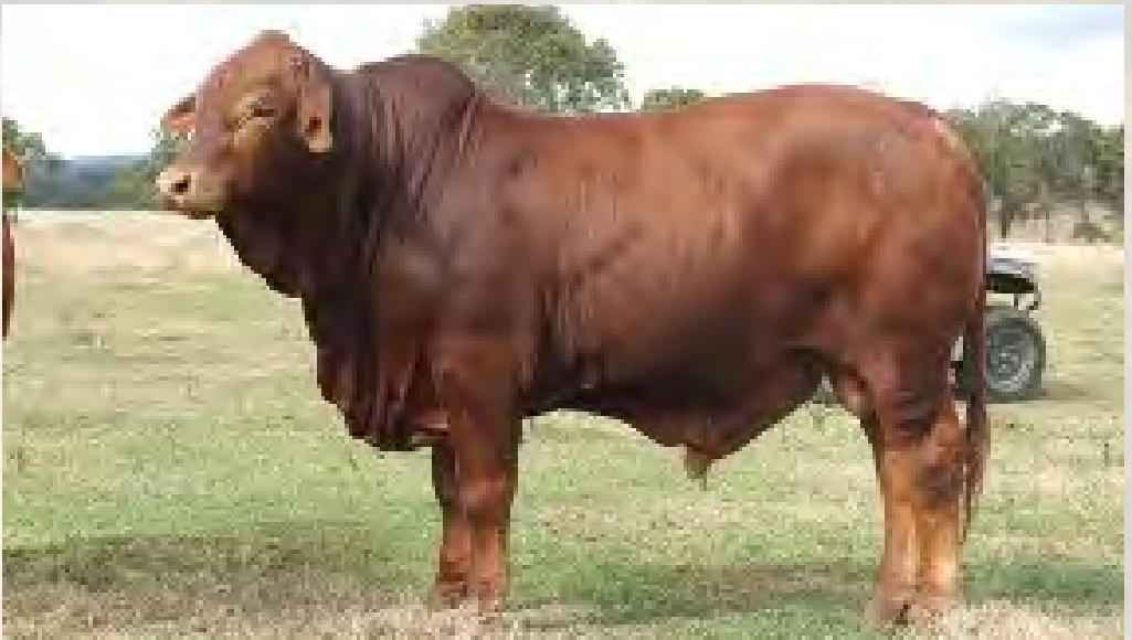
AMAVALE BRADMAN: Sire of VALERA VALE 15064M and of lots 1, 24, 25, 39, 62 & 88